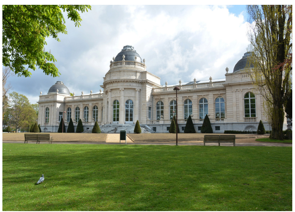
Musée de la Boverie, main entrance

of the permanent collections of the City of Liège. One storey of La Boverie is solely reserved for showing a selected pieces from the collections of the Museum for Fine Arts of the City of Liège. Ingres, Monet, Gauguin, Picasso, Pissarro, Evenepoel, Delvaux, Magritte, and others will walk the visitor through the Renaissance to our modern days. The upper level, on the other hand, hosts large-scale temporary exhibitions,