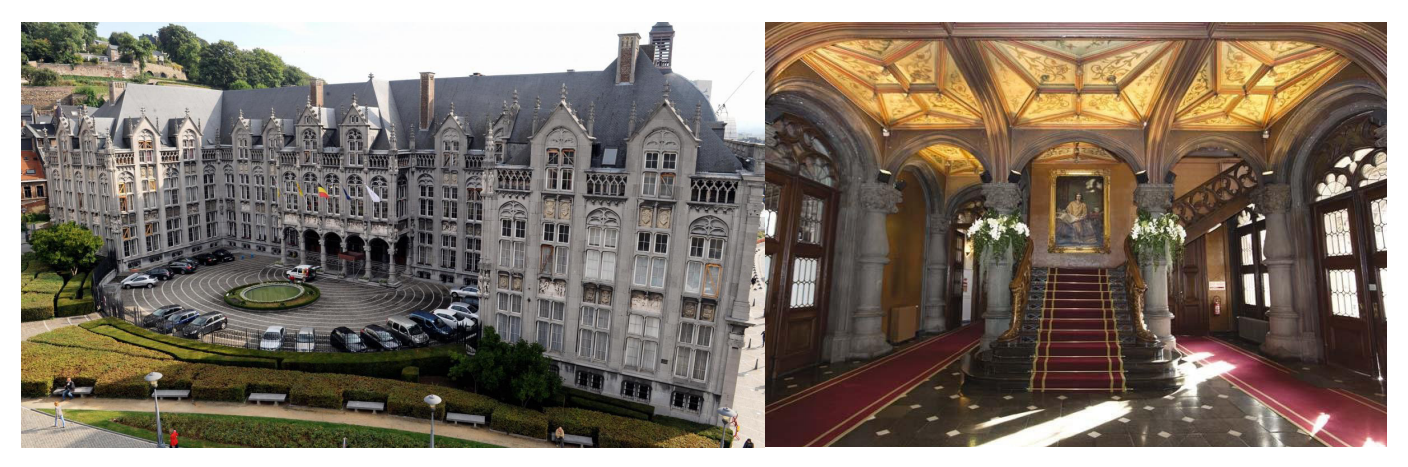
Left: Provincial Palace and Square Notger. Right: Ground floor of the Palais Provincial

ESHE participants will enter the building by the main entrance of the Palace of the Prince-Bishops, located on "Place Saint-Lambert" (Saint-Lambert Square). Pre-registration will take place on the ground floor hall of the "Palais Provincial" from 15:00 to 18:00 and will be followed by a cocktail in the "Salle des Pas perdus" and "Salle du Conseil Provincial" on the first floor from 18:00 to 19:30. Drinks for the cocktail are generously offered by the Provincial College.