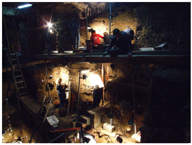
SCAC team and students from international universities excavating in Scladina Cave

on-field research programme on Palaeolithic archaeology in Belgium. This programme involves fieldwork, preventive conservation, management and digitalisation of collections, as well as conference and workshop organisations or scientific publications. When studying the cave findings the team either resorts to on-site based researchers or to an ever growing collaboration network. Preventive archaeology operations related to the Prehistoric period also