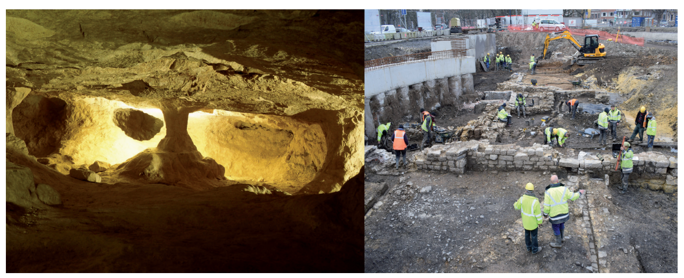
Left - The Neolithic Flint Mines at Spiennes (Mons, Belgium), inscribed into the list of Unesco World Heritage Sites in 2000. Right – Excavations in 2018 at the Grognon, the city of Namur's historic heart, at the confluence of the Sambre and Meuse rivers.

For more information visit: https://agencewallonnedupatrimoine.be/lagence-wallonne-du-patrimoine