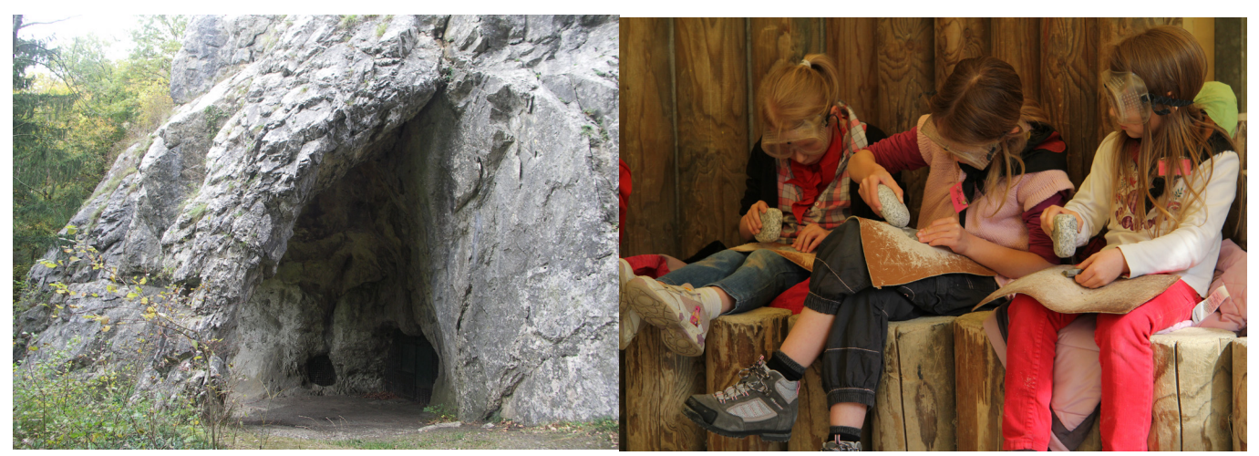
Left: Cave terrasse in Goyet. Right: Children trying out flint knapping

Since the 1860s Goyet cave has brought an abundant assortment of lithic artefacts, fauna remains, bone tools, ornaments and art objects from the Middle Palaeolithic to the Neolithic to light. Unfortunately, this material is deprived of reliable stratigraphic context due to both taphonomic processes and inaccuracy of the excavations. Recently, numerous human remains were discovered in the bone collections: several Neanderthals individuals from the Late Middle Palaeolithic as well as Homo sapiens sapiens from the Upper Paleolithic. This discovery made Goyet the largest palaeolithic human remains collection in North-West Europe and has allowed the use of recent methods to provide valuable information on the behavior and genetic history of European Paleolithic populations.