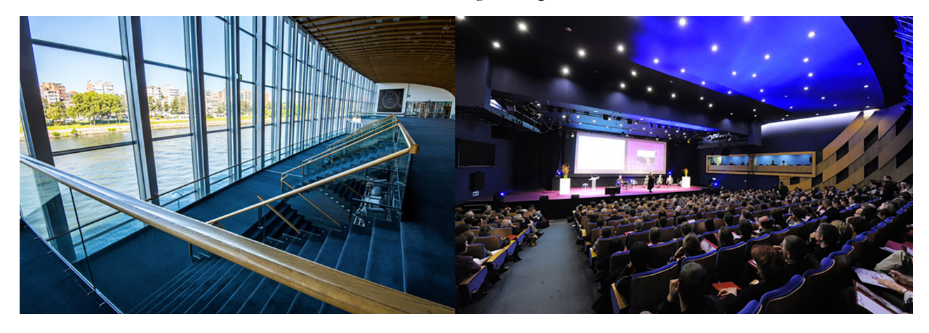
Left: Grand Foyer. Right: Auditorium

This year's conference will take place in the "Palais des Congrès" (Convention Centre) of Liège. The Palais is situated between the banks of the Meuse River and the Parc de la Boverie, one of the most beautiful green spaces in the city. The "Palais des Congrès" is within walking distance from the city's historical centre and the Guillemins railway station thanks to a recently built pedestrian bridge. Other undeniable assets of the site are a 4-star hotel (Vander Valke Hotel) and an on-site free parking area.