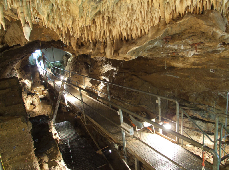
Scladina cave

continuouslybyprofessionalarchaeologists. The stratigraphic sequence comprises ca. 150 layers, recording the climatic fluctuations of the last 200,000 years and yielding the richest palaeontological collection of Northwestern Europe. A dozen of archaeological assemblages have been identified, three of which are of outstanding significance: an early Weichselian butchery site (assemblage 5),